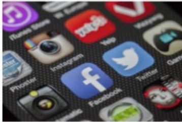
Follow them on social media