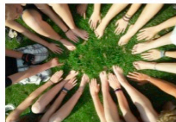
Join community & volunteers' groups