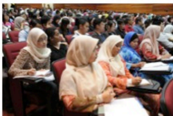
Attend public events