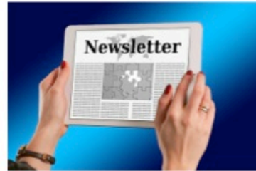
Register on their newsletters