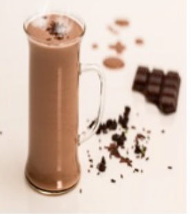
The Latin name for the cacao tree, Theobroma cacao, means "food of the gods."

Cacao beans were used as currency in pre-modern Latin America.