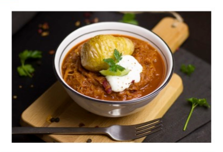
You can't beat a good Irish Stew!